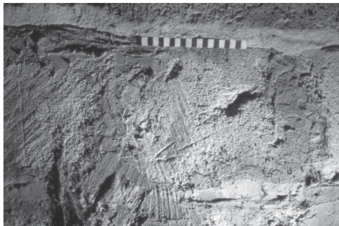
FIG. 3 Blyth Priory, mason's mark on stone above later nave vault.