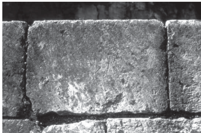
FIG. 5 Roche Abbey, mason's mark on nave N. aisle wall.